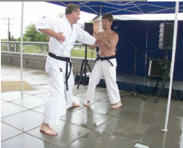
Jim Koch (left) and Dan Goberman demonstrate Uechi-Ryu Karate